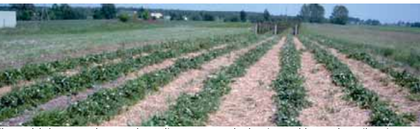
The mulch between the strawberry lines protects the berries and keeps the soil moist.

heavily affect strawberries. For the same reason, strawberries should not be grown close to these crops. On the contrary, intercropping with beans, spinach or onions can be very beneficial.