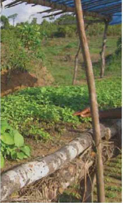
Seedlings on a raised seed bed.

It is important not to apply any fertilizer. Young seedlings need soil low in nutrients, but they love loose, airy soil. Therefore, it is advisable to add some sand, sawdust (not from eucalyptus), reserved to nurse seeds.